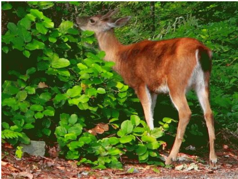
Hungry white-tailed deer can eat much of the vegetation in a forest that is within their reach. NPS

A recent study by several NPS Inventory and Monitoring networks assessed regeneration metrics in 39 parks from 2008 to 2019, including at ANTI. Parks were placed in one of four regeneration categories (Secure, Insecure, Probable Failure, and Imminent Failure), based a variety of metrics that represent the amount and diversity of tree regeneration. Forests in 27 of 39 parks were classified in either imminent or probable failure categories due to a lack of seedlings and saplings in the understory. The study identified overabundant white-tailed deer and invasive plants as the leading causes of concern for forest regeneration. For more detailed information on the full study, see the source publication in the Resources section below.